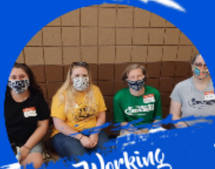
Working Blood Drives