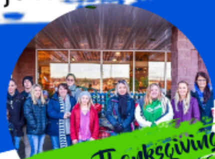
Delivering Thanksgiving Dinners