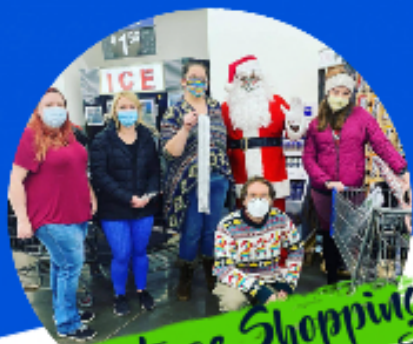
Christmas Shopping for kids

Do you want to join a group of local leaders? We welcome you to join us!